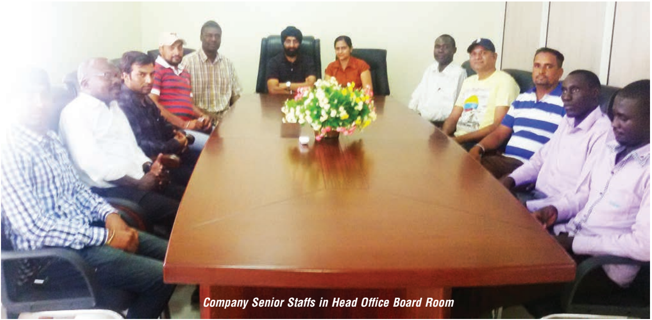
Company Senior Staffs in Head Office Board Room