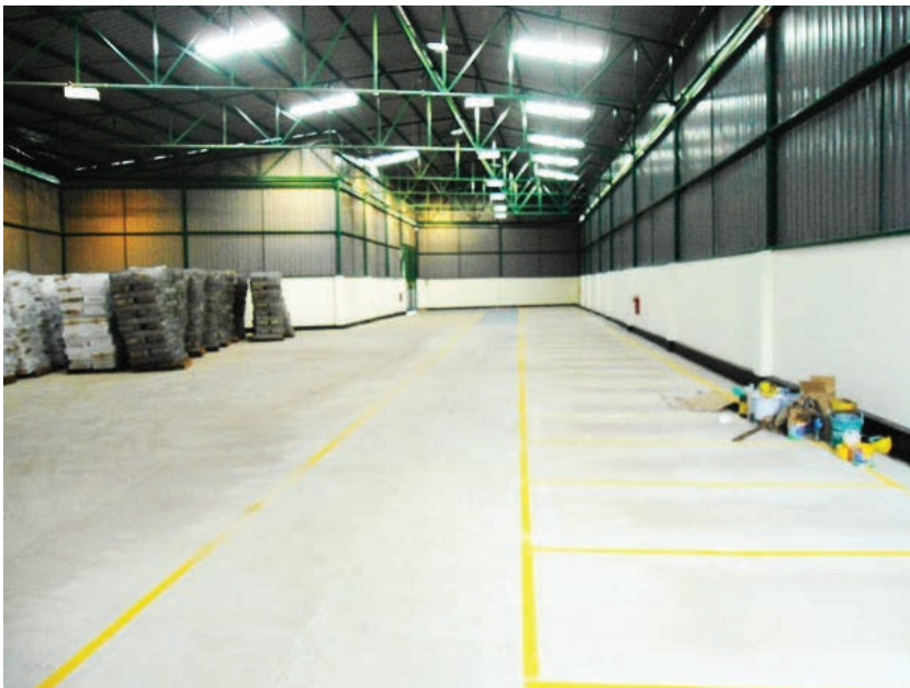
Uganda Breweries Limited (UBL) - Luzira

Since 2012 we have excuted mult billion modern labs, warehouses and office facilities in these two oragnisations.