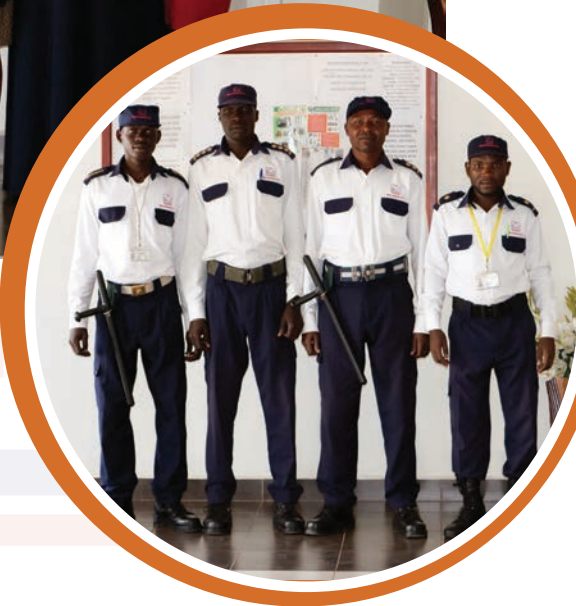
>> KDL Senior Security Officers