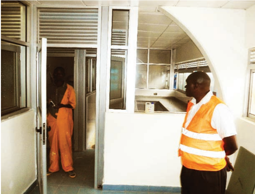
Crown Beverages (U) Limited

The high health safety and environmental management systems in these organisation have set Khalsa Developments (U) Ltd outstanding.