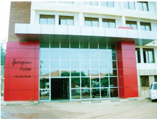
Georgian House on George Street, Kampala (Formaly AMAMU House)