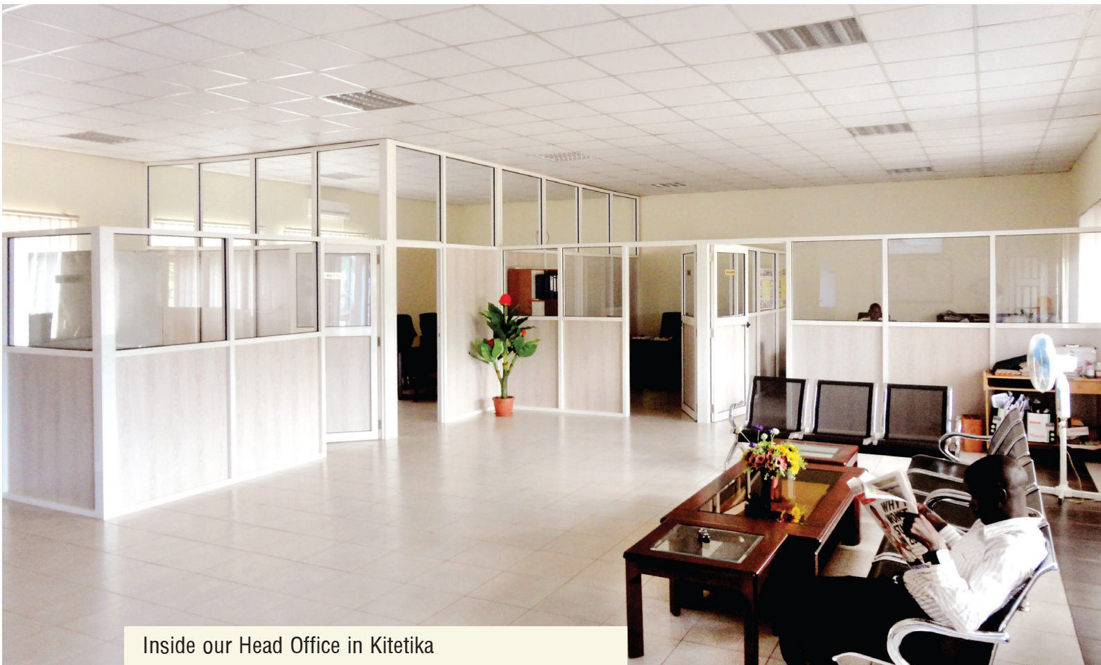
Inside our Head Office in Kitetika