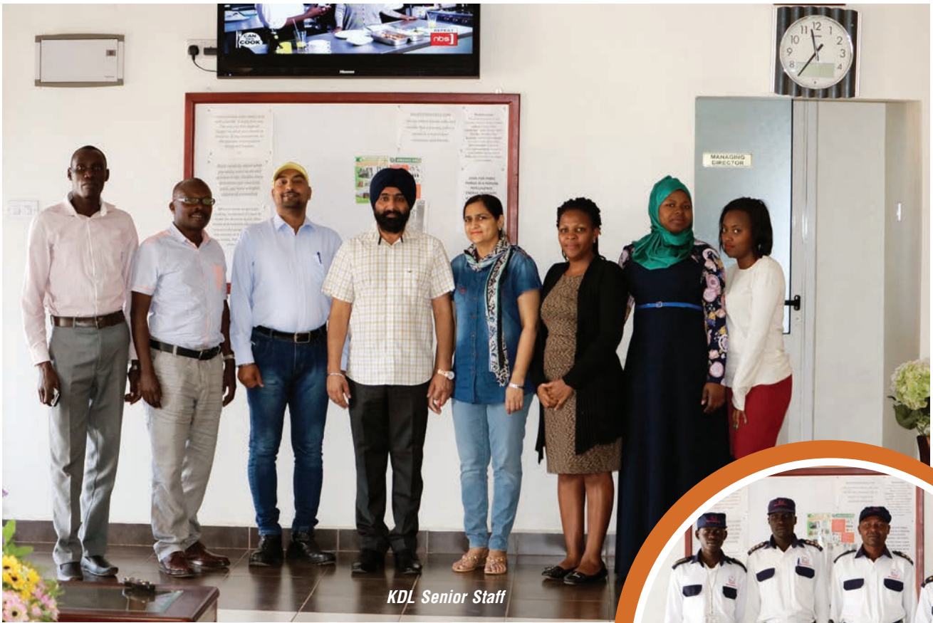
KDL Senior Staff